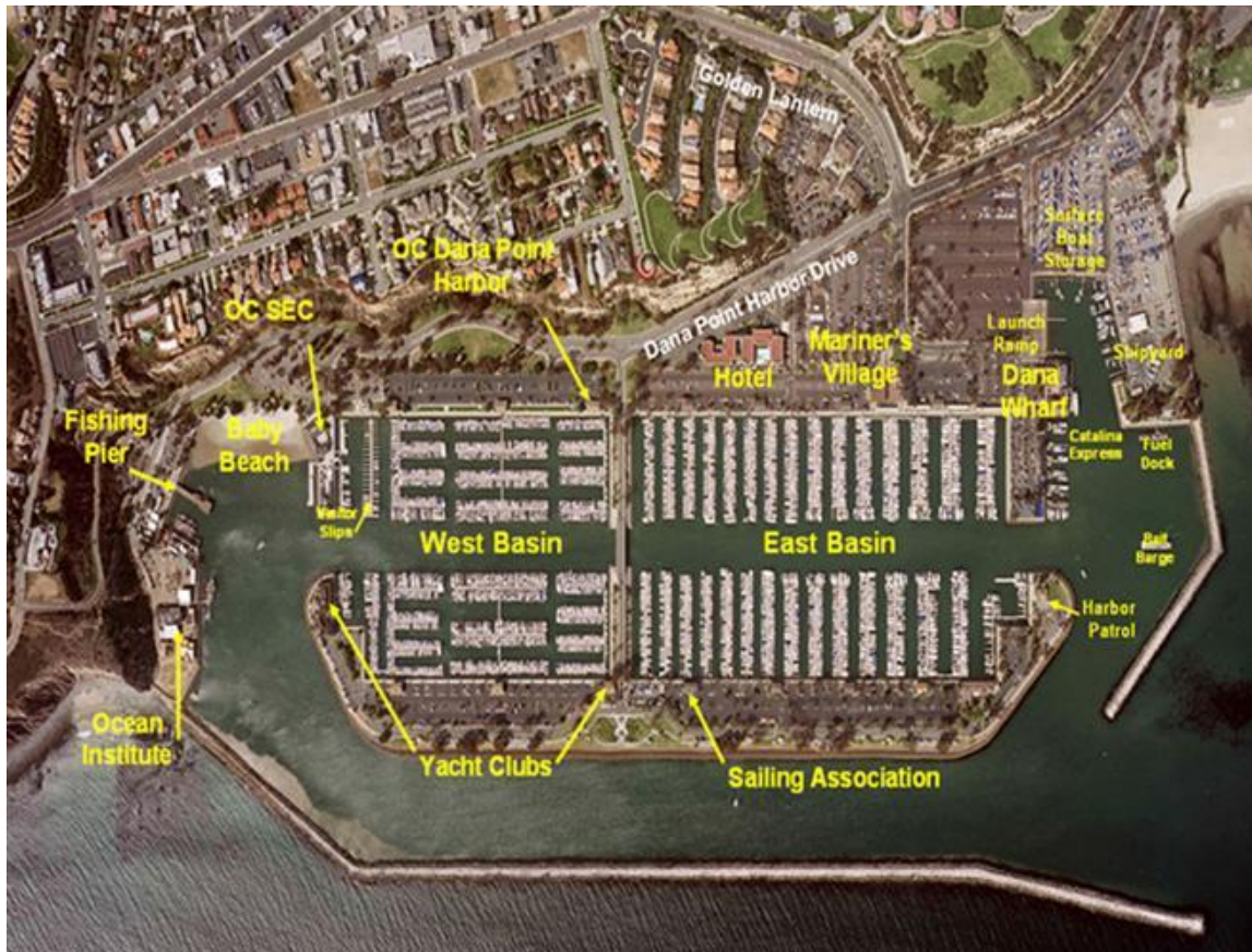
Fig 4. Aerial Legend of Dana Point Harbor

Starting at the west end of Dana Point Harbor Drive is the Ocean Institute housed in a structure used for the education of county youth about marine science and maritime history. Next is Baby Beach, which offers tables and grassed park areas and a swim beach area. The DPH office is located adjacent to the entry of the Island Way Bridge. Further east is Dana Point Marina Inn, a 212 room hotel operated by Great Western Hotel Corporation. This hotel strives to achieve a three star status while adhering to the guidelines established by the CCC policy. Adjoining the hotel is a commercial zone consisting of free parking and eateries.