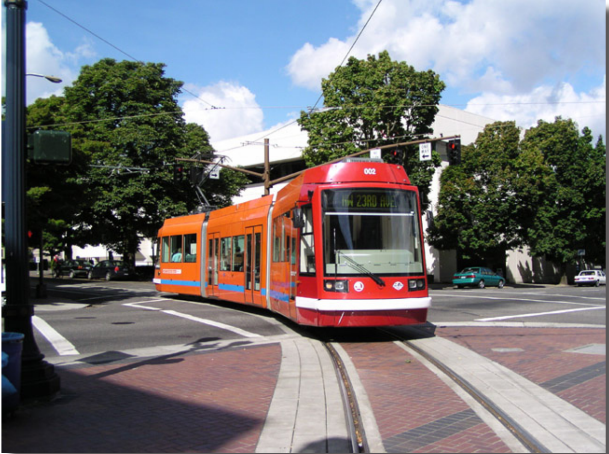
Model: Santa Ana Street Car (City of Portland)