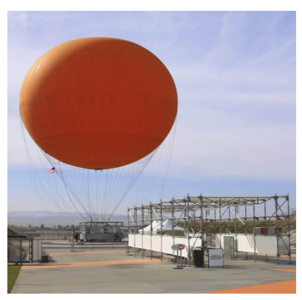
The iconic orange balloon that is the highly visible symbol of the Orange County Great Park takes visitors 400 feet high for a tethered view of the Park site. The balloon flies Thursday through Sunday.

But when the Great Park Board met for the first time on Dec. 5, 2003, it adopted bylaws that changed the Board's composition. The amended