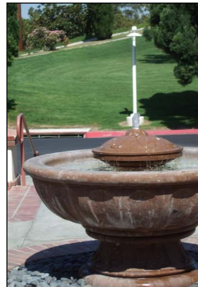
Looking toward El Toro Memorial Park cemetery from OCCD headquarters

The grand jury conducted a comprehensive study of the history, operation, and effectiveness of the cemetery district and of its direction for a financially sound future. Research included: 1) comparative study of pricing at privately held cemeteries and pricing in the OC Cemetery District (see chart in Section 5.6.2); 2) visits to the three district cemeteries; 3) interviews of OCCD trustees and staff, the county coroner's management and staff, members of historical societies, and LAFCO staff; attendance at OCCD board meetings and presentations; and 4) reviews of documents (see Section 10, Bibliography).