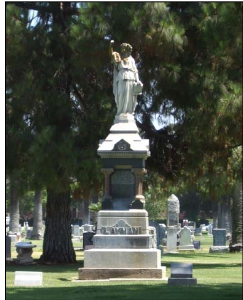
Some of the historical grave markers at Santa Ana Cemetery

The district's remaining income sources are: 1) the sale of grave sites, mausoleum spaces, urn niches, ash scattering, and related services; 2) interest on invested income; and 3) revenue from a land-use agreement with a cell phone communications company.