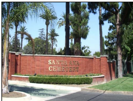
Entrance to Santa Ana Cemetery

OCCD is a "special district," defined as an agency formed for the performance of specific and proprietary functions. Ground burial, mausoleum interment (Anaheim), urn niches, and ash remains are the only services provided by district cemeteries. Any Orange County resident, of any income level, may be buried in any OCCD cemetery.