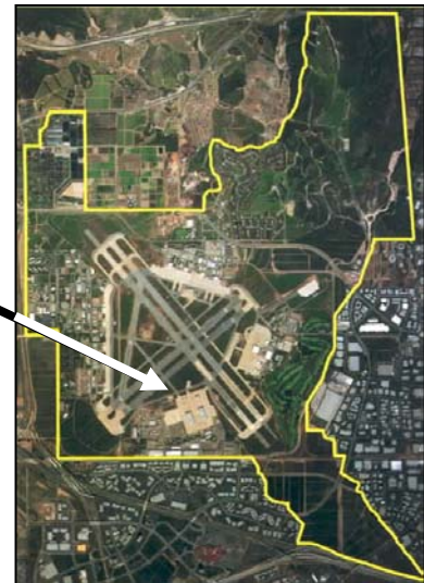
Great Park Corporation's Great Park aerial view and parcel diagram. Arrow points to possible cemetery location.

6.5.2 There is one other cemetery owned by Orange County; it is the historical and non-operational Yorba Cemetery, cared for by the