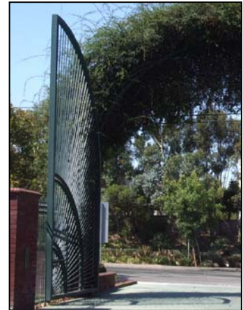
Entrance detail, El Toro Memorial Park

The board of trustees hires the general manager, who has the responsibility of managing all three district cemeteries. The offices of the general manager are maintained at the district office, El Toro Memorial Park. Members of the board of trustees are paid $100 each, per meeting, not to exceed $400 per month. They also receive expenses for conventions, seminars, etc. The board meets on the first Tuesday of each month at 10:00 A.M. at one of the three cemetery locations. Meetings are open to the public and must be conducted in accordance with the Brown Act.