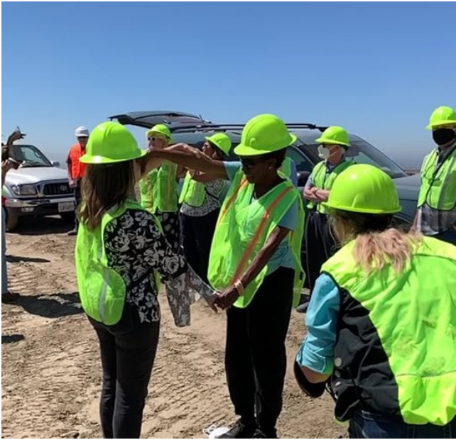
Orange County Grand Jury tour of landfill in Brea, CA